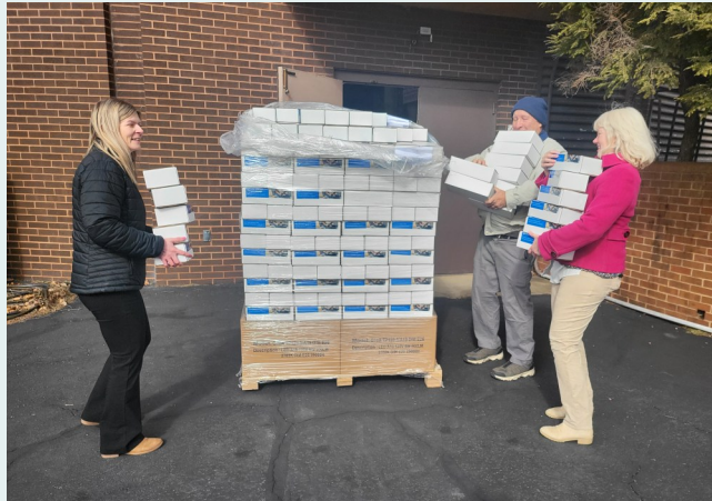
LED lightbulbs from TVA arrive at FTAAAD offices for distribution to local households and organizations