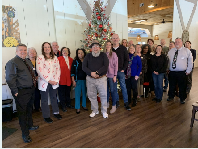
FTAAAD Advisory Council and staff at the annual Holiday Luncheon