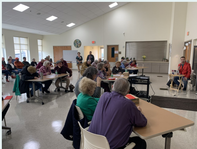
The 2nd Annual Brain Olympics were held at the Jonesborough Senior Center on December 17.